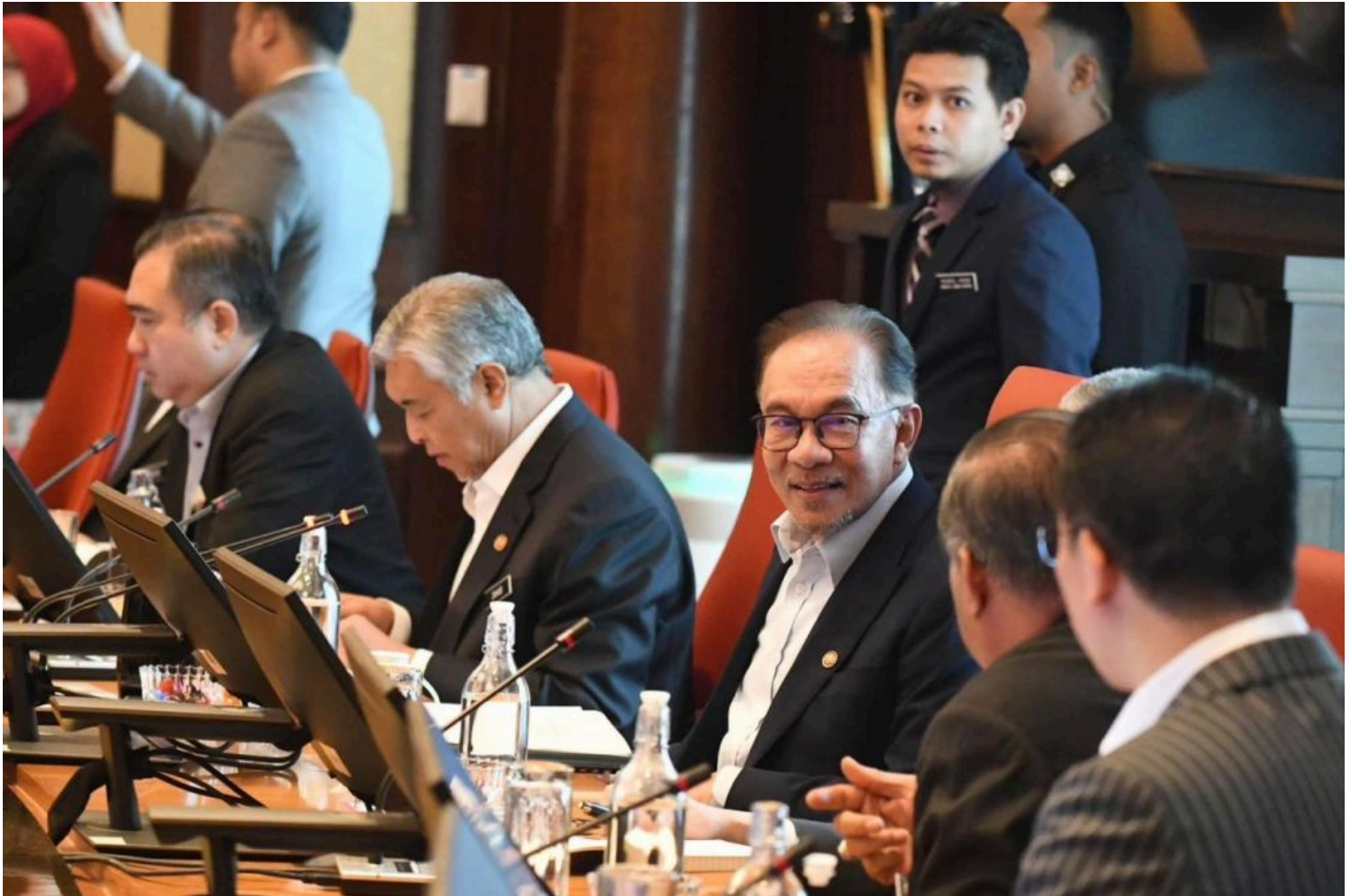
Incorporating Umno into the cabinet will provide more conveniences and indirectly strengthen Umno.

Last updated 11 months ago · Published on 25 May 2023 2:20PM · 0 comments