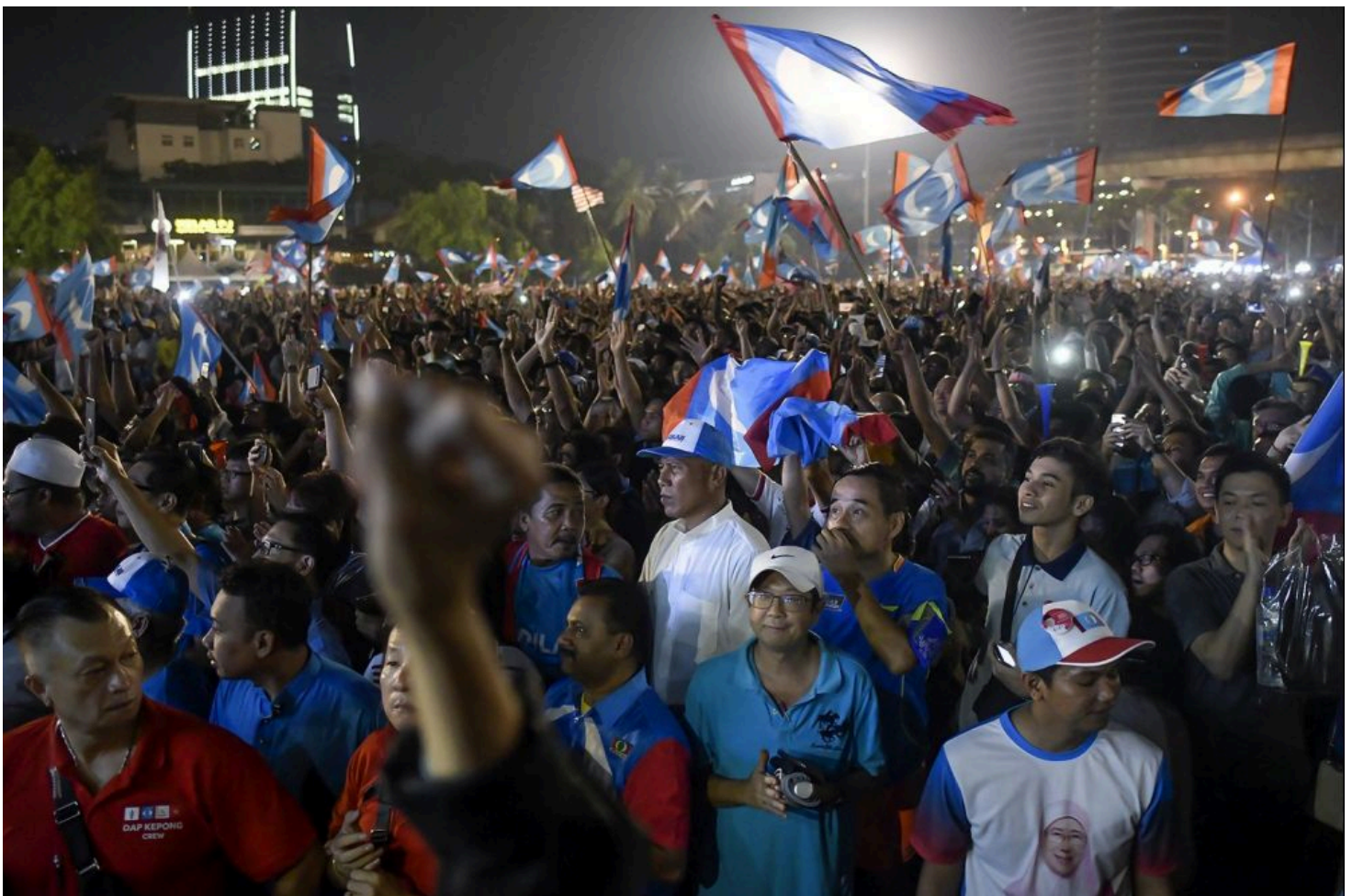
The author believes that politicians who run as independent candidates rarely win elections. Leaving the original party emblem also means that the voters who previously supported them also leave.

However, to be fair, we should try to see the situation from the other person's perspective and try to discuss the issue in a neutral way. You can say that what the opposition is planning is unreasonable and ungentlemanly, but to some extent some people think it is legal and consistent with democracy. As stated above, while I am happy with how this administration has performed so far, others have the right to think this administration sucks, just like President Trump. No matter how much you hate him, he is legal under election rules. elected.