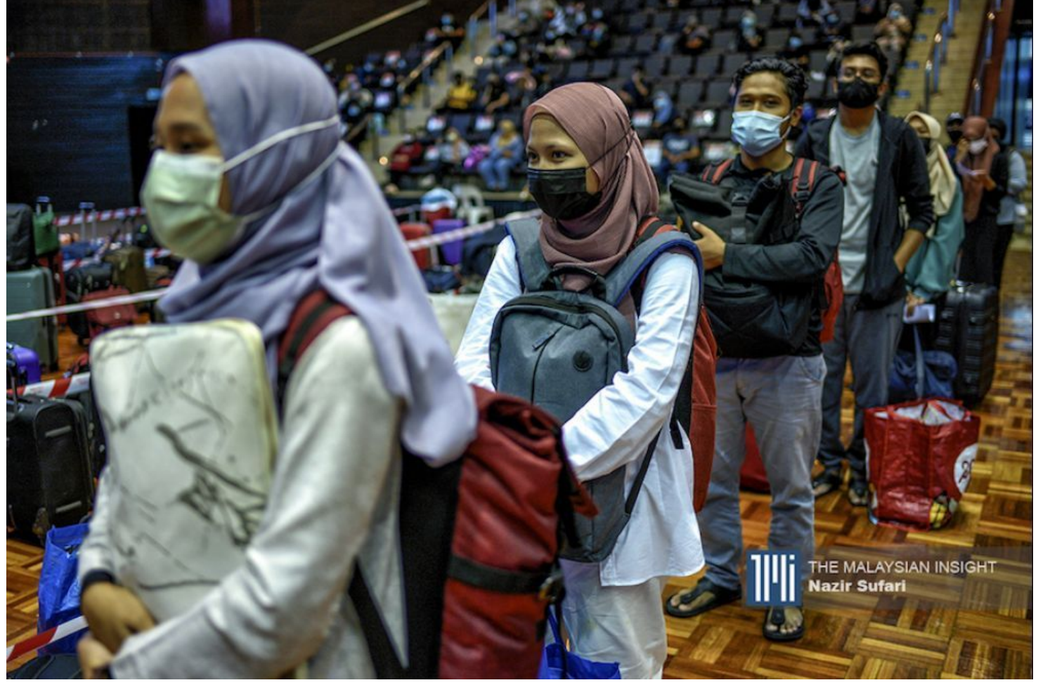
Things are different now. University lecturers used to mingle with their students, but now they are estranged from each other.

Nowadays, teaching in universities, not only in our institutions, but also in other public and private institutions, has a lot of administrative paperwork to deal with. Lecturers have now strayed from their core responsibility of teaching and can no longer perform nurturing roles. Many university systems look good on the surface but are redundant in practice. For example, the system of mentoring students was deliberately promoted, but students did not come to the mentors, including me. Students don't come to me because it's not based on trust. Therefore, it takes time to build trust between lecturers and students.