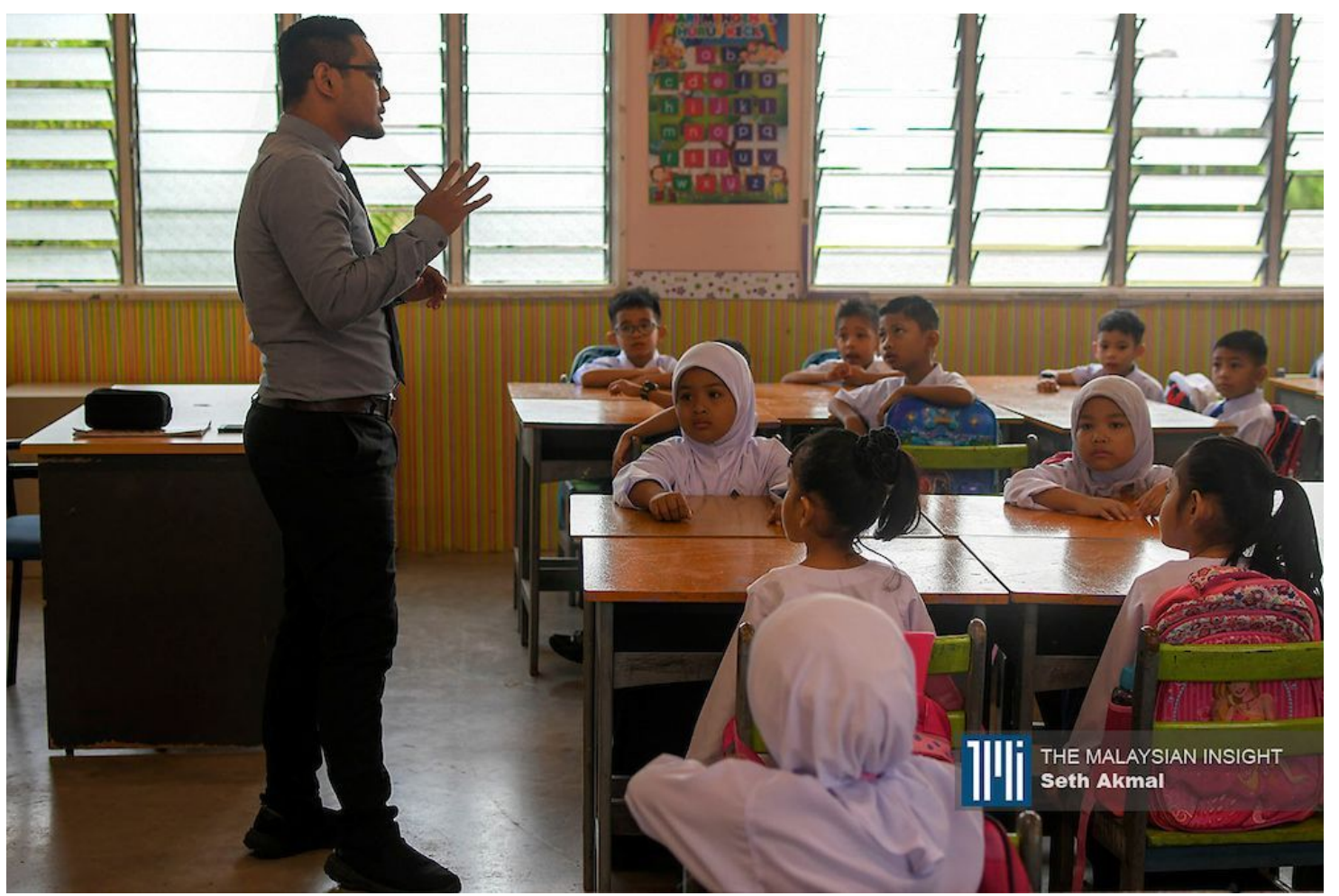
State and private higher education institutions have tied their teaching staff to handle countless administrative paperwork. As a result, lecturers have now deviated from their core responsibilities of teaching and can no longer perform training tasks.

Last updated 1 year ago · Published on 13 Apr 2023 2:22PM · 0 comments