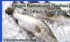
Frozen Barramundi [Seabass] [Whole Round / Fillet]