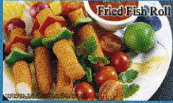
Fried Fish Roll