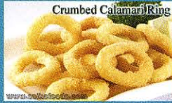
Crumbed Calamari Ring

Crumbed Calamari Rings, Crumbed Prawn Cutlet, Crumbed Fish Finger, Crumbed Fish Fillet [various flavors], etc.