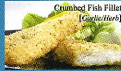
Crumbed Fish Fillet [Garlic/Herb]