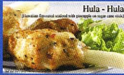
Hula - Hula (Hawakita flavoured scallop with pineapple on sugar cane stick)