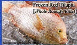
Frozen Red Tilapia [Whole Round / Fillet]