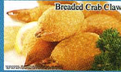
Breaded Crab Claw