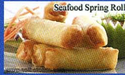
Seafood Spring Roll