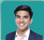
SYED SADDIQ BIN SYED ABDUL RAHMAN PRESIDENT, MALAYSIAN UNITED DEMOCRATIC ALLIANCE (MUDA) PARTY (AIKOL - 2016)