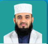
DR. MIZANUR RAHMAN AZHARI RENOWNED ISLAMIC SCHOLAR / ACTIVIST (KIRKHS - 2015, 2022)