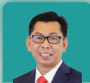
DATUK MOHAMAD BIN ALAMIN DEPUTY MINISTER OF FOREIGN AFFAIRS, MALAYSIA (AIKOL - 1996)