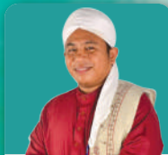
USTAZ MUHADIR BIN HAJI JOLL RENOWNED ISLAMIC PREACHER / BOOK AUTHOR (KIRKHS - 2000, 2004)