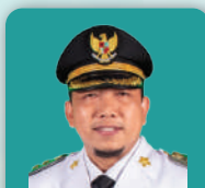
H. HUSNI MERZA DEPUTY MAYOR CITY OF SIAK, RIAU PROVINCE (KENMS - 2002)