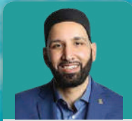
DR. OMAR SULEIMAN FOUNDER & PRESIDENT YAQeen INSTITUTE USA (KIRKHS - 2022)