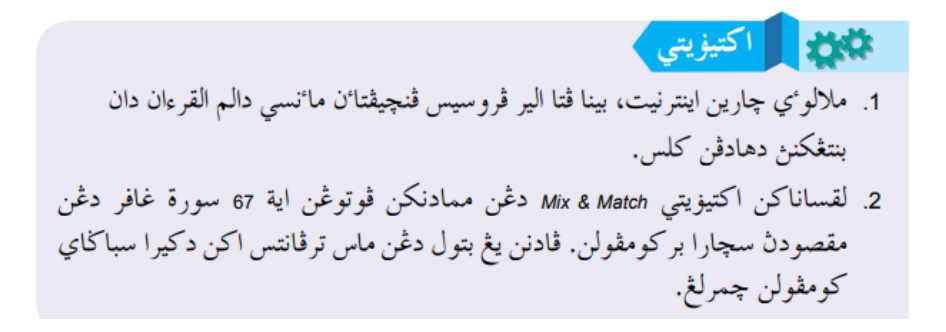
Figure 2: Activities Suggested in Textbook (Rijaludin Yahya et al., 2018)

This topic motivates everyone to investigate and find other materials in different discussion groups. This will create a conducive way of learning and teaching in the classroom and improve student behavioural responses. The suggested activities can be practiced in school or done as homework, as shown in Figure 2. Teachers must manage the time accordingly if the activities are planned to be distributed in groups. The assessment part portrayed an excellent indicator of global competency and motivated students to be involved in active thinking. This is a tremendous effort in the era of digitization of the new generation in this century.