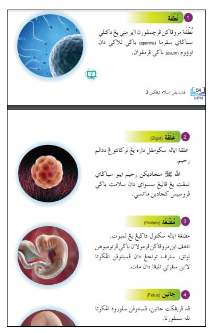
Figure 4: Sequence Of Human Creation (Rijaludin Yahya et al., 2018)

The textbook is the most vital teaching aid since it is the primary reference that is both useful for students and assists teachers in accomplishing their objectives. The most apparent feature of the textbooks is in terms of picture management, as their primary function is to disseminate concepts in abstract or concrete form. In this chapter, the sequence of human creation and development is organized with the accurate term used and easy-to-digest information, as shown in figure 4. The color and appearance of the diagram seem exciting and able to guide the student to follow the chronology in the process. In our opinion, we would like to suggest the video of actual human birth is attached as a video to be watched by students accompanied by their teacher for a better explanation. Nayef (2015) stated that a textbook helps achieve the curriculum objectives if it contains valuable materials, has an attractive appearance as well as readable and prolifically written.