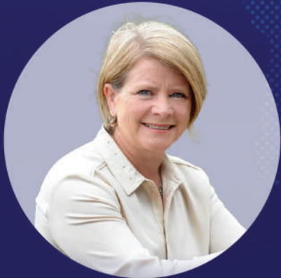
Panellist 2 : The Hon Karlene Maywald South Australian Water Ambassador