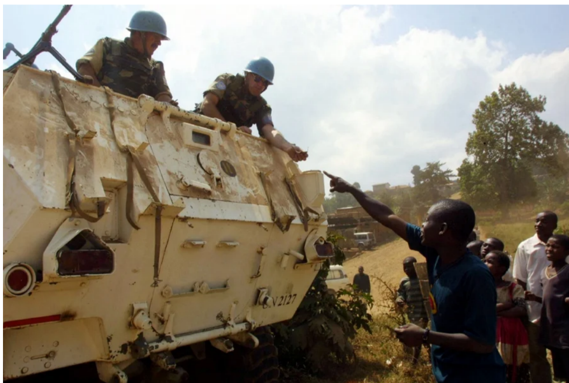
Photo taken on June 11, 2004 United Nations MONUC peacekeepers talk with children in Bukavu after the town's recapture by regular forces, following an occupation for several days by military dissidents under General Laurent Nkunda.

By Dr.Thameem Ushama - January 18, 2023 @ 4:10pm