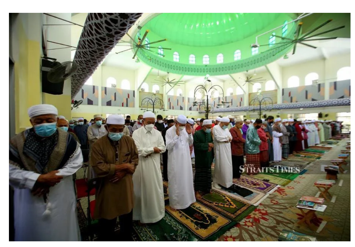
Muslims must emulate the Prophet's gracious demeanour towards all people.