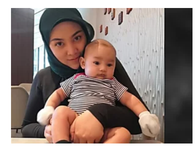
#Showbiz: Shila Amzah confirms divorce from husband of four years | Ne... New Straits Times