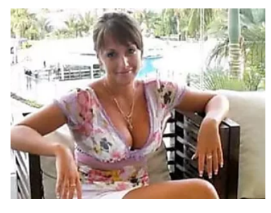
Men, You Don't Need The Blue Pill If You Do This Once A Day Sponsored | iamhealth.life