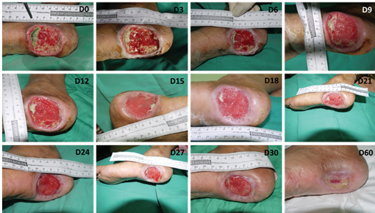
Fig. 3 Wound healing progress. Wound assessment was done every 3 days until the wound bed was prepared for secondary wound closure with a split skin graft. By day 24, the wound was ready for secondary wound closure using a split skin graft.

is that full-thickness wounds with cavities (large in size) will take a longer time for primary wound closure. Hence, this study demonstrated the use of CDHP for wound bed preparation before the secondary intention of wound closure. Almost all wounds demonstrated new granulation tissue and less necrotic tissue in the wound bed over the time points.