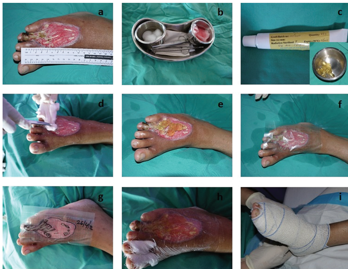
Fig. 1 Wound toilet preparation and dressing application. The wound was photographed with a disposable ruler (a), wound dressing set; 0.9% normal saline and 0.5% CHD solution (b), Chitosan gel (c), wound toilet cleaning (d), Chitosan hydrogel gel on wound bed (e), wound was covered with Opsite flexigrid and traces using marker pen (f–g) the grid layer of Opsite flexigrid was removed (h), a bandage was applied as a secondary dressing (i).