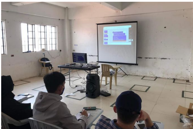
The desktop, projector and speaker donated by IIIT to RC-AKIC (RC Al Khwarizmi International College Foundation Incorporated).