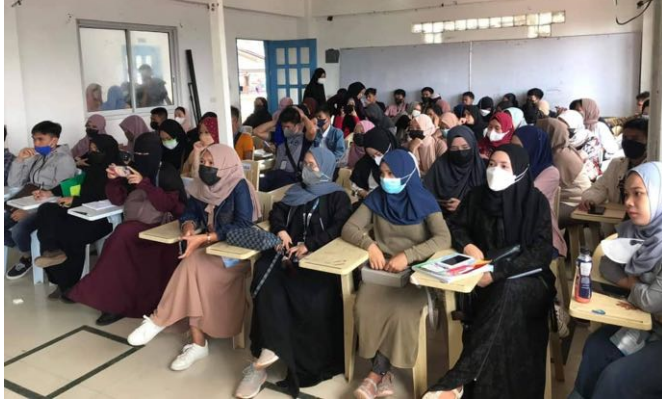
Students and young lectures of AKIC participating in the Online Seminar on Integrating Islamic Values in Handling Mental Health and Emotional Well-being held this month.

utmost gratitude to IIIT & IIIT SEA for their recognition as partner of the Institute towards the Integration of Knowledge in the Philippines. The same thing goes to the Institute of Islamic Studies University of the Philippines Diliman and Imam Council of the Philippines Incorporated.