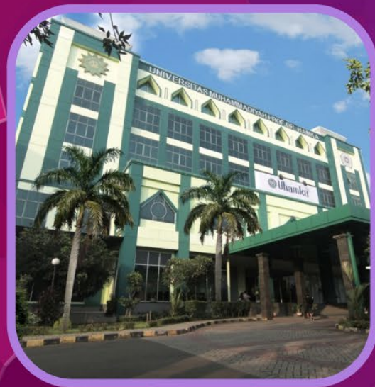
Faculty of Pharmacy and Sciences, Universitas Muhammadiyah Prof. Dr. Hamka