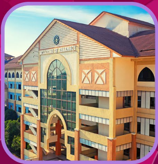
Kulliyah of Pharmacy, International Islamic University Malaysia